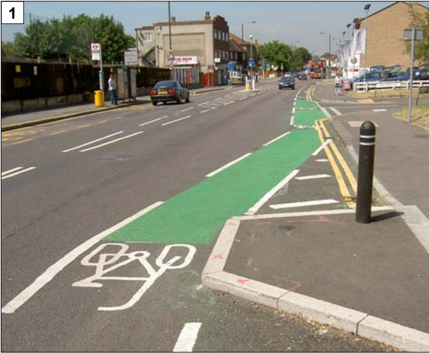
◀ Scheme Photo 1

Scheme Code: BS\LCN\BEX.07 Link Number: Link 12 spur Location: Welling Town Centre access Description: Jointly funded local safety scheme to provide advanced stop lines, cycle logos at side roads and colour surface at conflict points and also improved lighting (contribution only). Cost: £104 000 Length: 1.75km