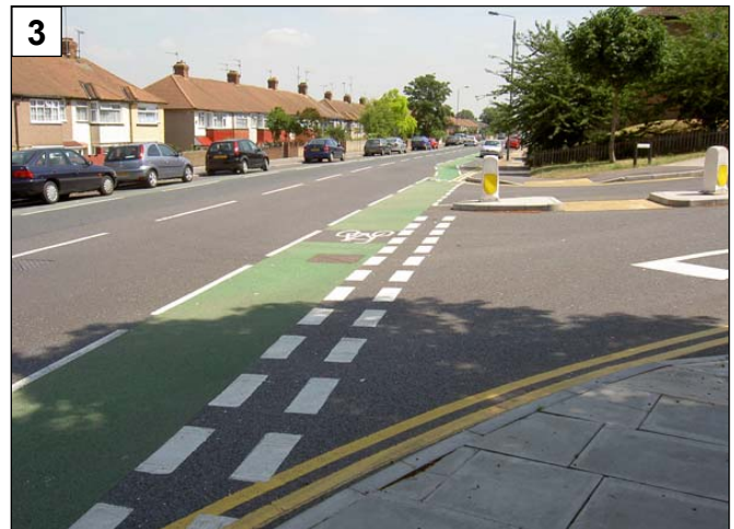
▲ Scheme Photo 3

CRISP BS\LCN\BEX.01 Link Number: 12 CRIM undertaken: 12.7.04 Final CRISP report: April 2005 Cost: £12 000 Length: 10.46km