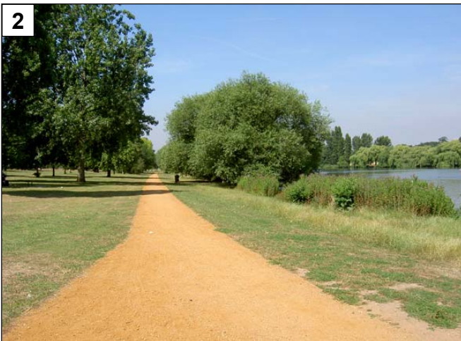
▲ Scheme Photo 2

Scheme Code: BS\LCN\BEX.07 Link Number: Link 12 spur Location: Welling Town Centre access Description: Jointly funded local safety scheme to provide advanced stop lines, cycle logos at side roads and colour surface at conflict points and also improved lighting (contribution only). Cost: £104 000 Length: 1.75km