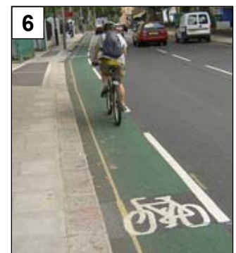
▲ Scheme Photo 6

Scheme Code: BS\LCN\CAM.07 Link Number: 28 Location: Royal College St Description: Re-surfacing and upgrades Cost: £59 700 L: 0.55km