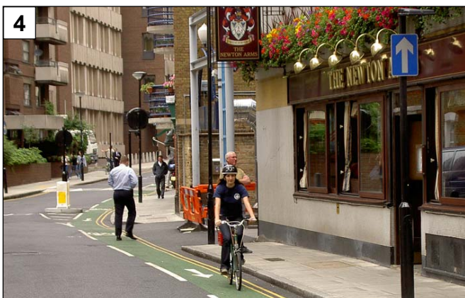
▲ Scheme Photo 4

Scheme Code: BS\LCN\CAM.01 Link Number: 28 Location: Royal College St at junction with Georgina St Description: Modification of existing junction (Upgrade Signals and redesign segregated cycle lanes) to provide improved continuity of North\South cycle route Cost: £66 500 Length: 0.11km