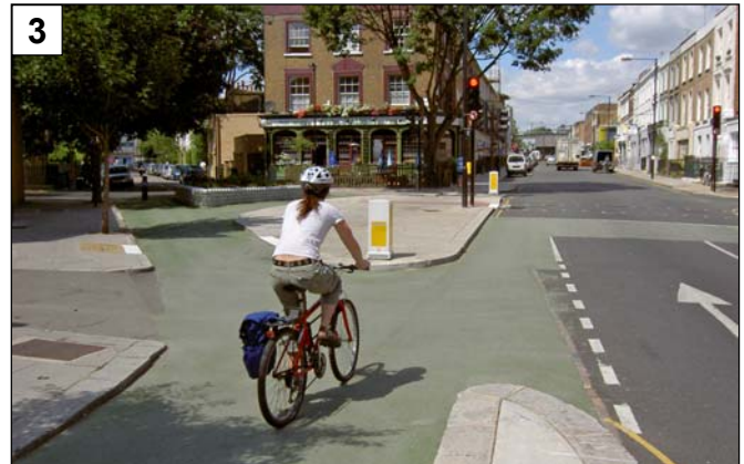
▲ Scheme Photo 3

Scheme Code: BS\LCN\CAM.02 Link Number: 28 Location: Malet Street - Montague Place - Montague Street Description: Conversion/widening of existing one-way segregated cycle lane to two-way linking to Seven Stations East-West Cycle route Cost: £130 000 Length: 0.29km