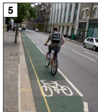
▲ Scheme Photo 5

Scheme Code: BS\LCN\CAM.04 Link Number: 28 Location: Newton Street: High Holborn to Gt Queen Street Description: Continuation of North South Route from junction of High Holborn into Westminster Cost: £76 800 Length: 0.18km