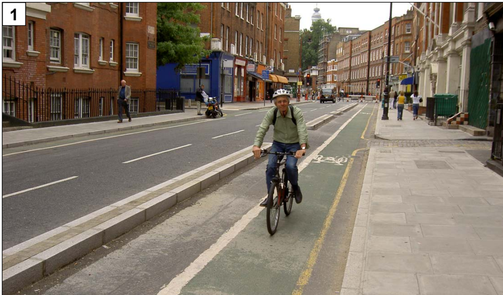
◀ Scheme Photo 1

Scheme Code: BS\LCN\CAM.03 Link Number: 30 Location: Tavistock place: between Marchmont Street and Judd Street Description: Continuation of East-West Route from Junction of Woburn Place (Segregated cycle lane; signal upgrade at 1 junction to accommodate cycle and pedestrian). Cost: £233 000 L:0.16km