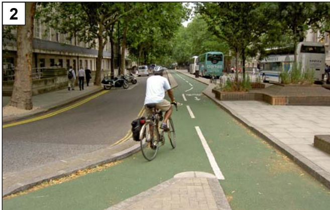
▲ Scheme Photo 2

BS\LCN\CAM.06 Sector Leader Fees Cost: £10 000