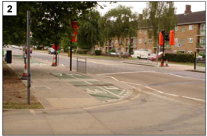
▲ Scheme Photo 2

Scheme Code: BS\LCN\HRW.05 Link Number: 88 Location: Station Road Description: Conversion of pelican crossing to cycle friendly toucan crossing. Cost: £28 075 Length: 0.08km