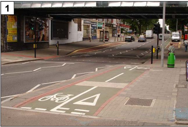
▲ Scheme Photo 1

Scheme Code: BS\LCN\HRW.05 Link Number: 88 Location: Station Road Description: Conversion of pelican crossing to cycle friendly toucan crossing. Cost: £28 075 Length: 0.08km