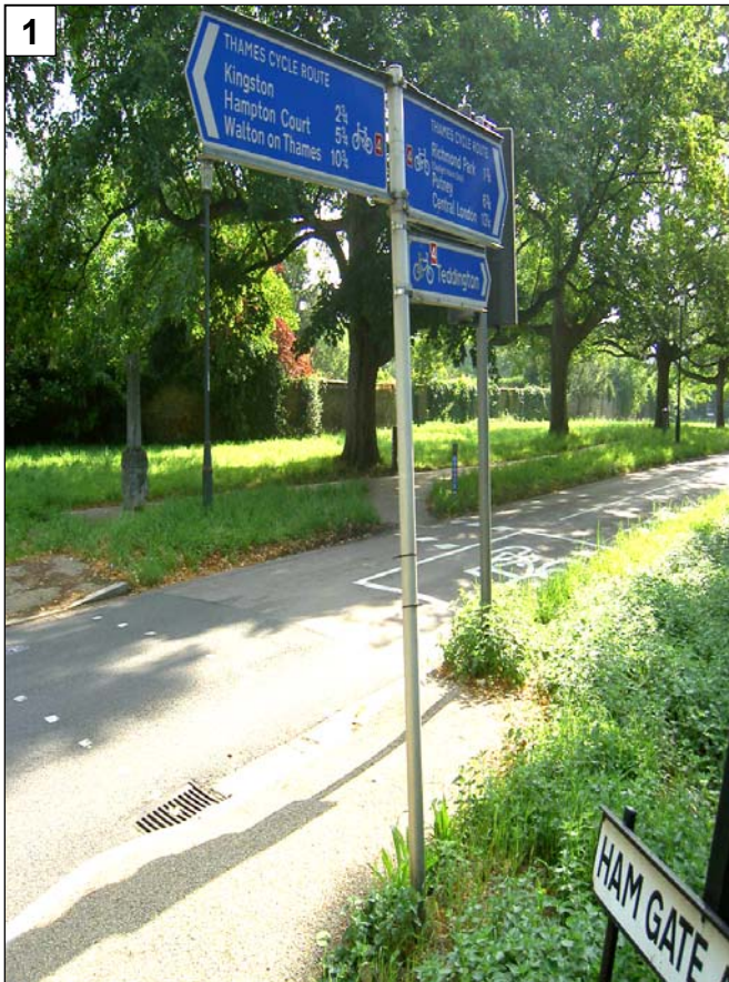
1 ◀ ◻ Scheme Photo 1 & 2 ▶ ◻ Scheme Plan 1