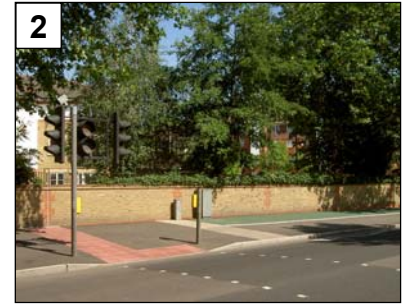
◀ ▲ Scheme Photo 1 & 2

Scheme Code: BS\LCN\SOU.01 Link Number: 182 Location: Rotherhithe Road \ Catlin Street Description: Relocation and Upgrade of existing Pelican into Toucan Cost: £55 980 Length: 0.24km