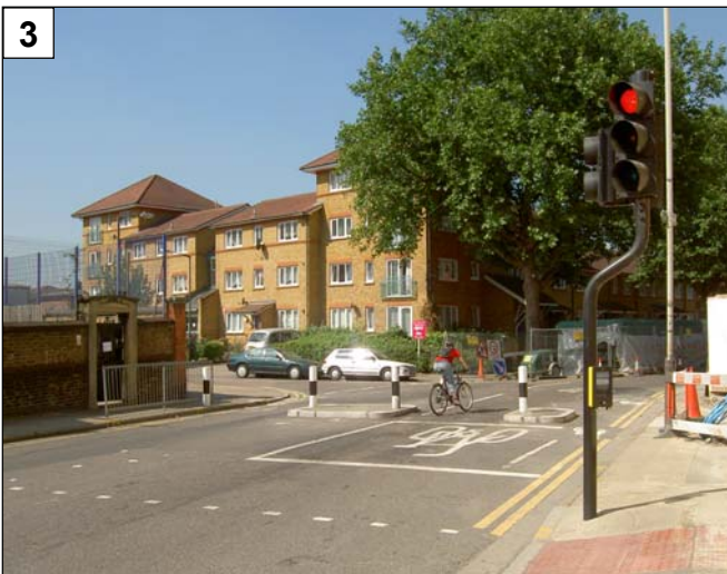
◀ Scheme Photo 3

Scheme Code: BS\LCN\SOU.01 Link Number: 182 Location: Rotherhithe Road \ Catlin Street Description: Relocation and Upgrade of existing Pelican into Toucan Cost: £55 980 Length: 0.24km