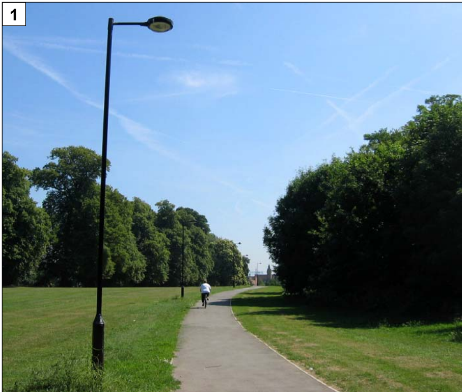
▼ ◀ Scheme Photo 1, 2