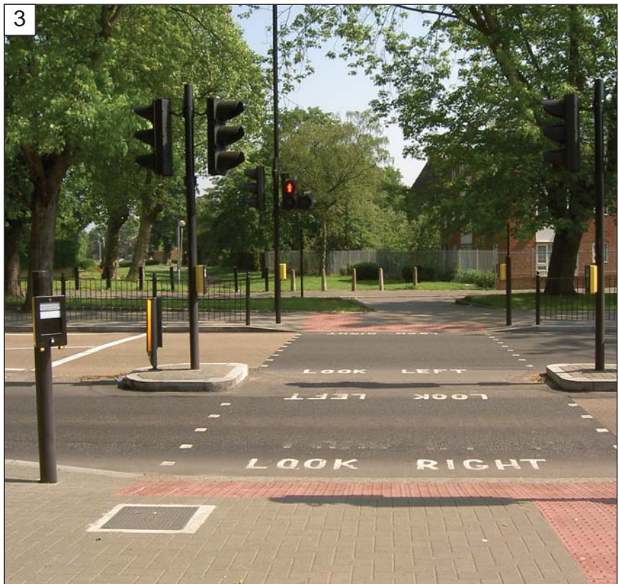
Scheme Photo: 3 Scheme Reference: BS\05\LCN\HGY.11 Location: Bounds Green Road Link number: 79 Description: Toucan crossing Length: 0.02km Cost: £44,000