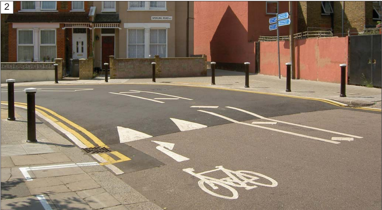
Scheme Photo: 2 Scheme Reference: BS\05\LCN\HGY.04 Location: Napier Road/Sperling Road Link number: 84 Description: CRISP study and provision of a cyclist cut-through at Napier Road/Sperling Road Length: 0.04km Cost: £57,100