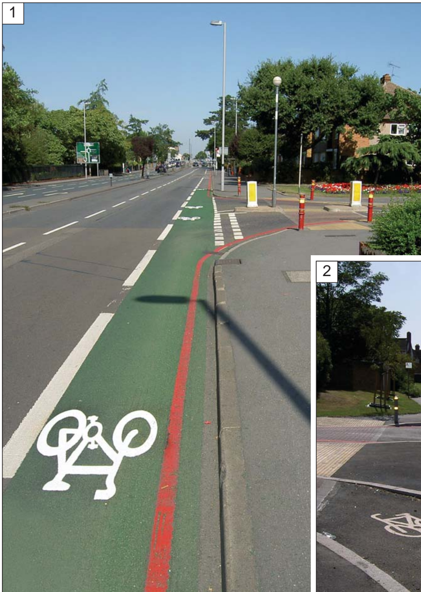
Scheme Photo: 1 Borough: Kingston Scheme Reference: IBP901129 Location: A243 Hook Road/Leatherhead Road Link number: 123 Description: Cycle Lanes surface treatment Length: 1.35km Cost: £203,276