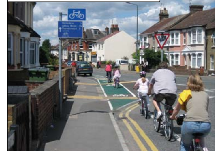
Scheme Code: BS\06\LCN\BEX.16