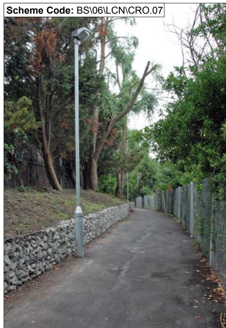
Scheme Code: BS\06\LCN\CRO.07

Scheme Code: BS\06\LCN\CRO.07 Link Number: 42 Location: Bridle Path Description: Widening of footway to facilitate cycling. Cost: £100,000 Length: 0.18km