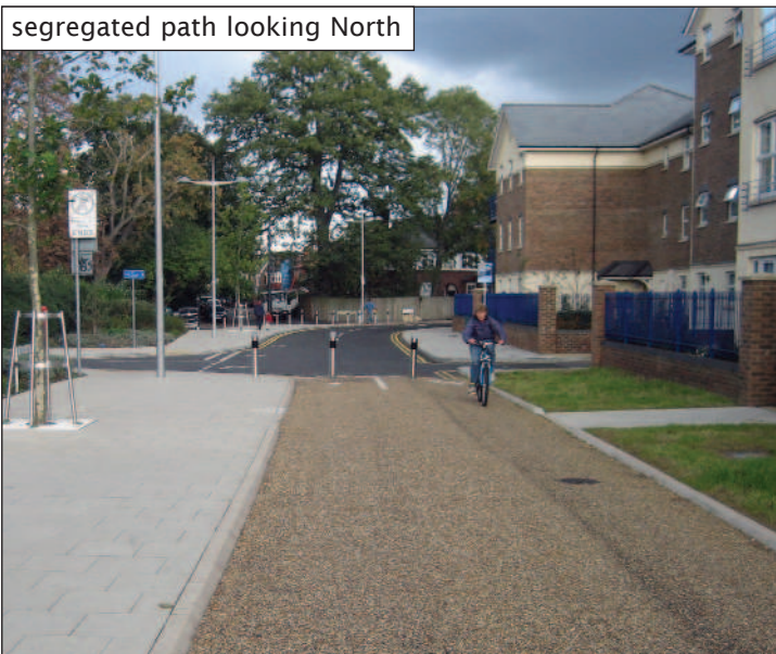
segregated path looking North