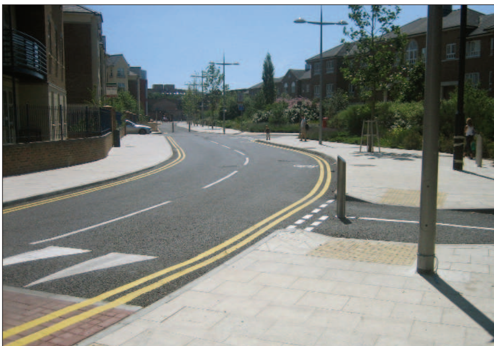
Left: exit/ entrance to segregated path