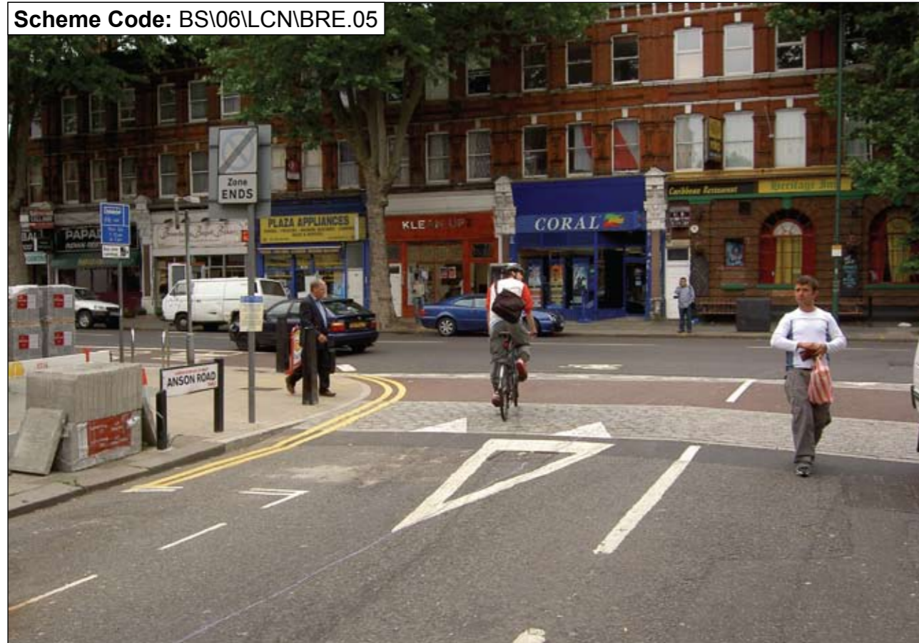
Scheme Code: BS\06\LCN\BRE.05

Scheme Code: BS\06\LCN\BRE.05 Link Number: 17 Location: A5 from Ash Grove to Oxford Road Description: Design and implementation of four raised entry treatments. Cost: £128,000 Length: 2.55km