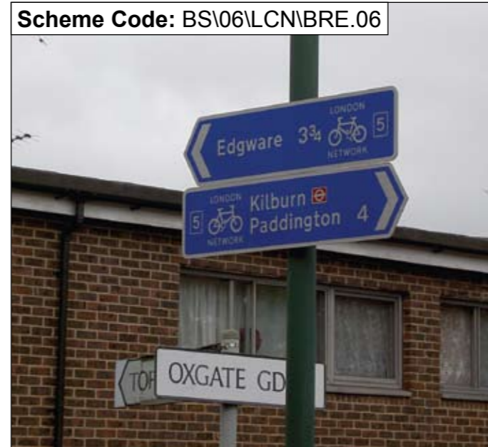
Scheme Code: BS\06\LCN\BRE.06

Scheme Code: BS\06\LCN\BRE.06 Link Number: 17 Location: A5 from Ash Grove to Humber Road Description: Implementation of entry treatment at Oxgate Gardens and signing throughout the section. Cost: £49,000 Length: 1.46km